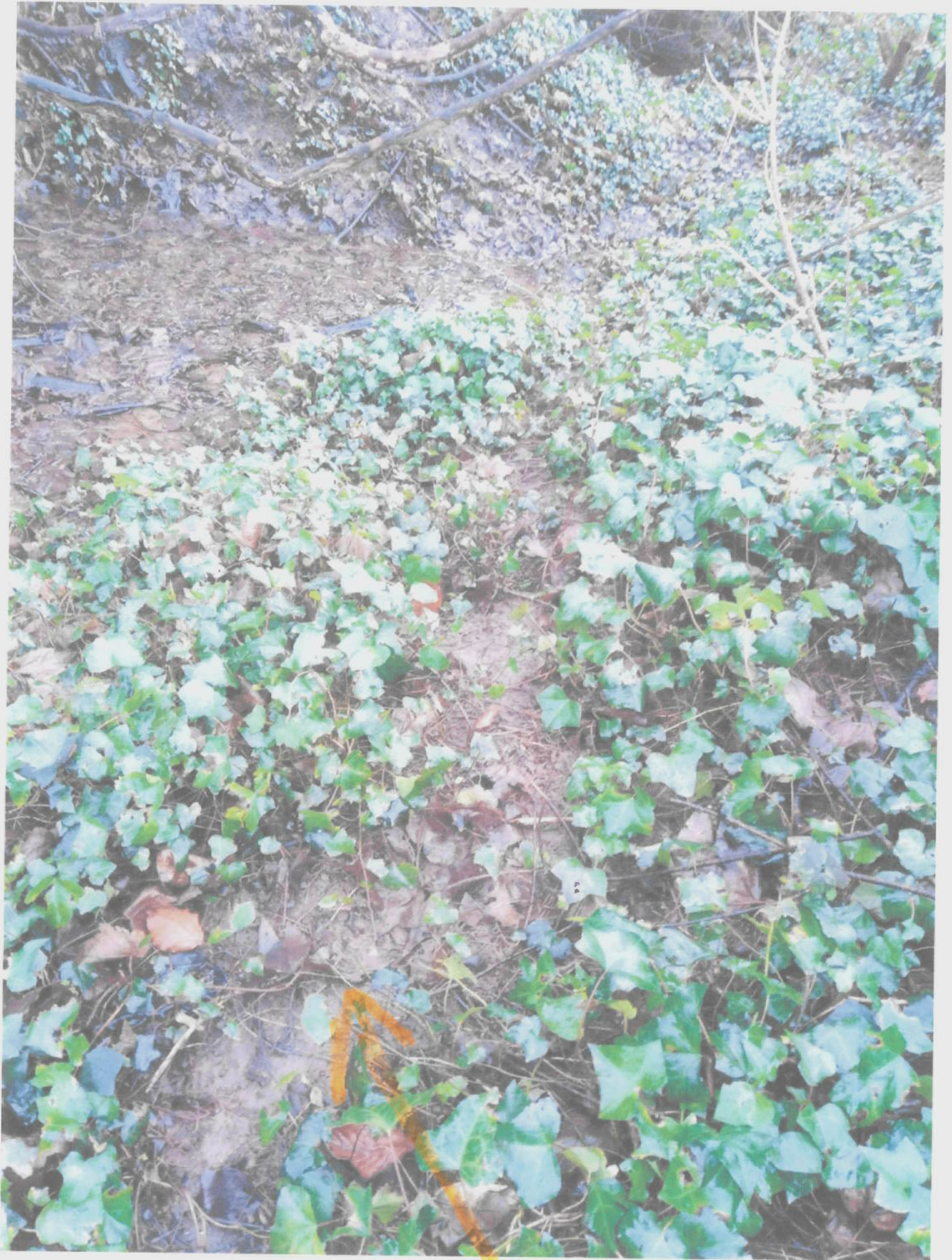
TRACKS INTO BADGERS SET.