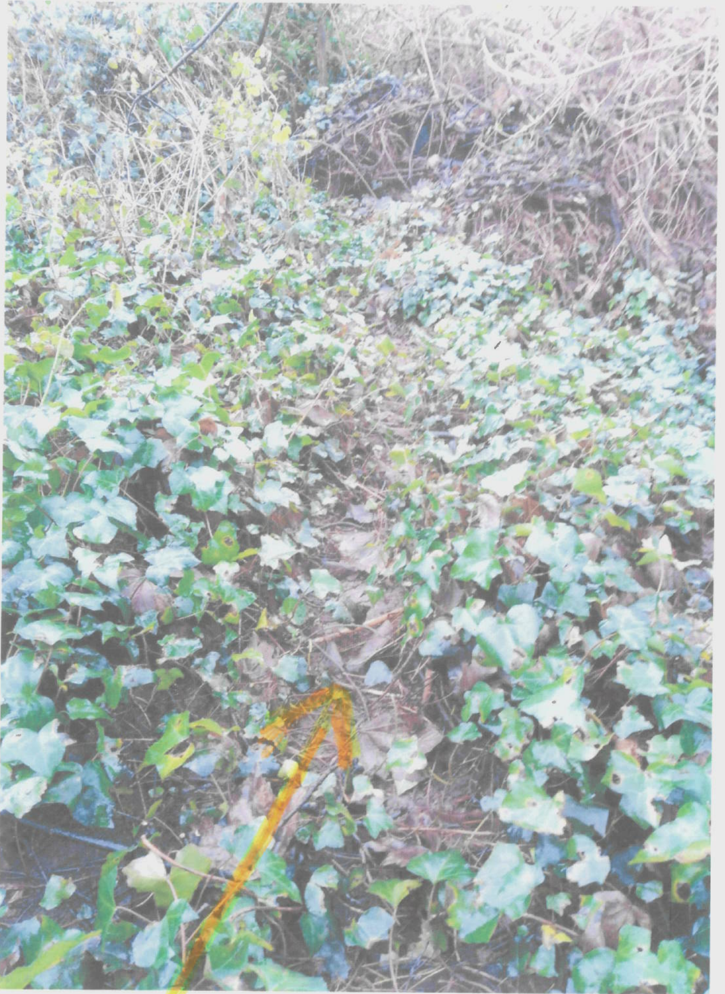
Tracks Into Badger Sets.