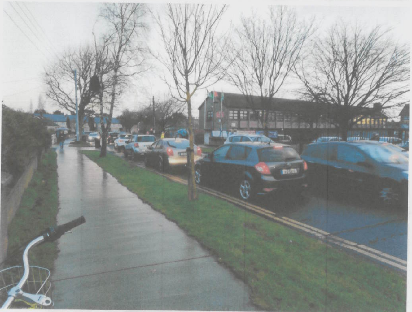
Photos showing already congested Kennelsford Road (1) and by Oval Junction (2)