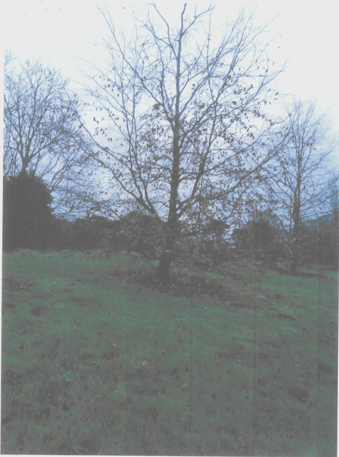
Mature Fagus sylvatica Purpurea trees which are feeding grounds to large local Bat Colony